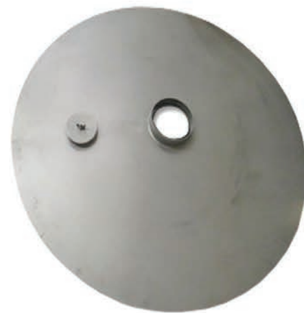
Dust Prevention Cover